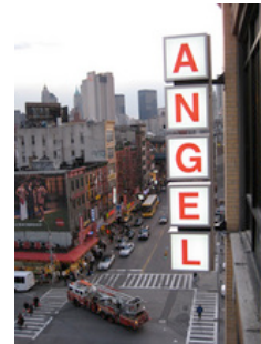
Untitled (Angel) , 2008, mixed media, 115 x 25 x 8".